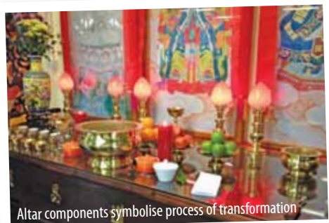
Altar components symbolise process of transformation

The new shrine is located at the headquarters of the Taoist Tai Chi Society of Australia, at 52 Railway Parade, Bayswater.