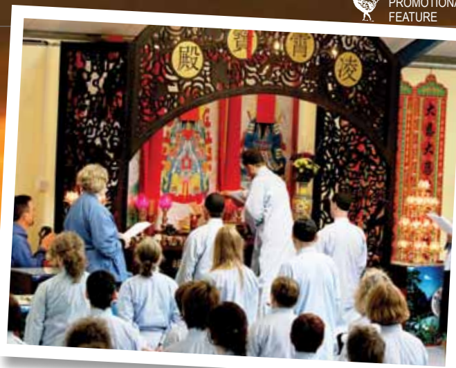
Chanting at the shrine

Find out more about us at www.taoist.org.au www.facebook.com/taoistaichiaustralia www.taoist.org (international web site) www.thetigersmouth.org (blog)